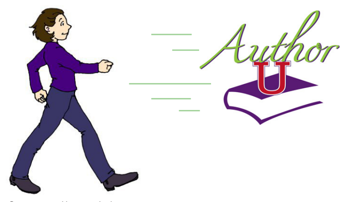
Cartoon